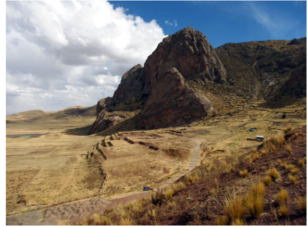
Figure 4. Archaeological site of Pukara. Stone-lined terraces and sunken court structures are known as the Qalasaya complex, and the Peñon is the large sandstone outcrop in the background. (Photo by Matthew Wilhelm, 2006.)

Titicaca Basin approximately 2,000 years ago (Figure 4). The monumental stone-lined platforms and sunken court structures visible today were built and used for several centuries by the Pukara culture. While our knowledge is limited regarding how or why Pukara was abandoned circa C.E. 400, there is ample evidence of subsequent site re-use and modification by the Colla, Inca, and Spanish over the following centuries. 2 Today, the adjacent town of Pucará is home to approximately two thousand Spanish- and Quechua-speaking residents who practice agro-pastoralism and are recognized throughout the region as pottery specialists. 3