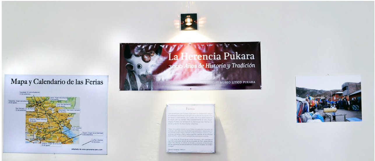
Figure 9. Wall banner for ethnographic sala and map of annual ferias (markets) visited by Pucará potters.