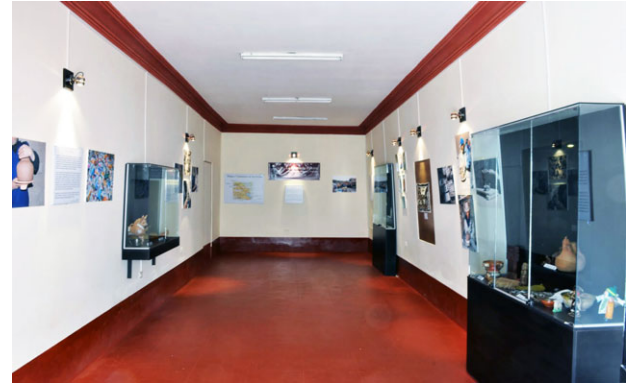
Figure 8. Overview of ethnographic sala.

The new sala, titled La Herencia Pukara: 3000 Años de Historia y Tradición (The Legacy of Pukara: 3,000 Years of History and Tradition), opened at the MLP in late January 2011 as a permanent exhibit space (Figures 8 and 9). It presents textile and pottery production as ubiquitous, dynamic, and interdependent practices in Pucará households. The cases display raw materials, tools, and finished products donated by local artisans, and they will be updated annually to allow for new materials to be incorporated (Figure 10). Numerous wall texts, including two production sequence diagrams, detail pottery and textile production. Each activity is broken down into stages: raw material procurement, materials preparation, and final production (adapted from Miller 2009). These stages are also illustrated with large-format