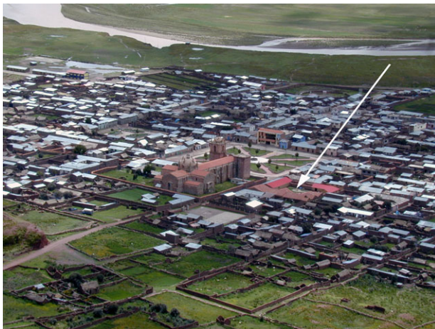
Figure 3. Location of the Museo Lítico Pukara in Pucará.