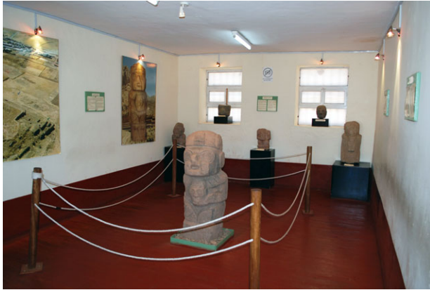
Figure 5. Prehistory sala in the Museo Lítico Pukara.

includes a lab space and residential area that houses the museum staff and visiting researchers. On an institutional level, the MLP is one of dozens of site museums operated by the Ministry of Culture, which is administered from Lima and has a regional office in the city of Puno, about two hours south of Pucará. 4