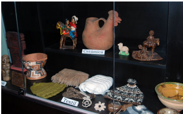
Figure 10. Detail of display case with weavings and pottery produced in Pucará.

geographical and cultural term (shared language, history, et cetera) that did not recognize or address the internal heterogeneity within Pucará. What “community” would be represented in the sala?